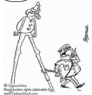
© OriginalArtist Reproduction rights obtainable from www.CartoonStock.com

What crime have we done? Is saving lives of our families a crime!!!!